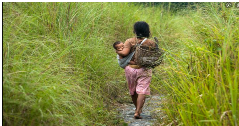
cob Maentz Iangyan of Mindoro