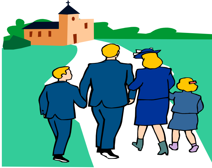
THIRD PICTURE: When Jesus grew

up, he began to heal the sick. He let the lame to walk, the blind to see, the demon possessed to be free, raised the dead. Jesus gave hope to the sick. To those people who need helps, Jesus help them.